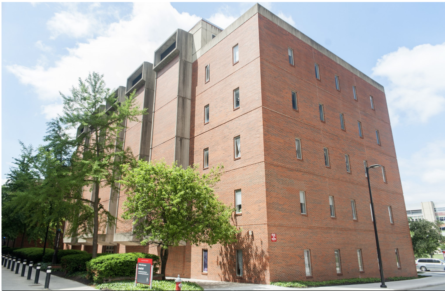
Atwell Hall, School of Health and Rehabilitation Sciences