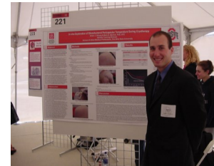
Students have opportunities to be involved in cutting edge research

New for 2016, we have created an early admission pathway where a limited number of spots in the program are guaranteed to students directly out of high school. Details are on our website.