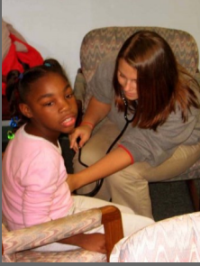
Our students provide care with a variety of patients, not just athletes.

Our most important goal is to prepare Athletic Trainers who are ready for independent practice on the first day of their first job.