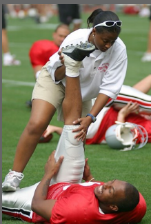
Our students complete 3 years of clinical fieldwork

Our most important goal is to prepare Athletic Trainers who are ready for independent practice on the first day of their first job.