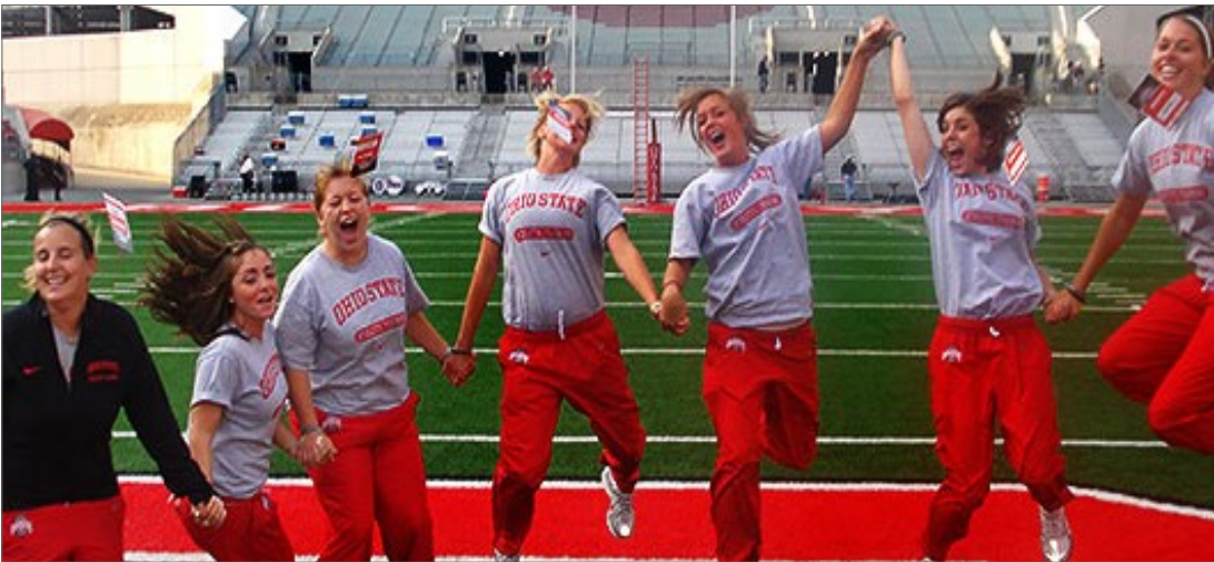
Ohio State's Athletic Training major is one of the top performing programs in the nation year after year.

All Athletic Training programs nationally will be converting by 2022 to award a Master's Degree. We are in the process of this conversion and are excited about what our new curriculum will include. Pending required approvals, we anticipate starting with our masters program in fall 2018 or 2019.